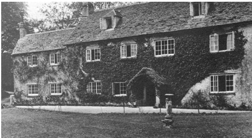
Fig. 2.1 The Old House at Rendcomb

Dr. Sanger stressed to his children that he hopes they grow up to treat all persons as equals [3].