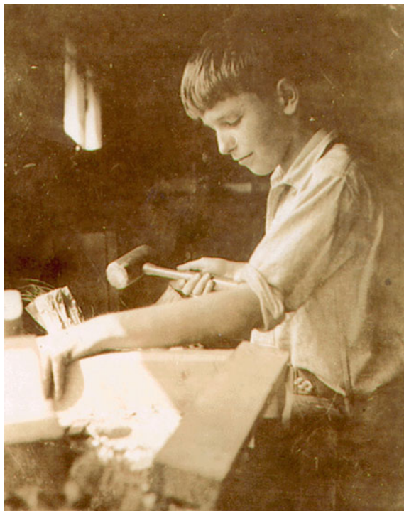
Fig. 2.4 Fred in the hut 1931