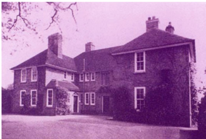
Fig. 2.3 Far Leys in Tanworth-in-Arden