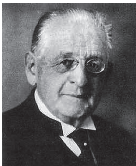
Fig. 2.2 Photo of Fedor Krause (Reproduced from Kolle [69]. In [54]. Permission required)