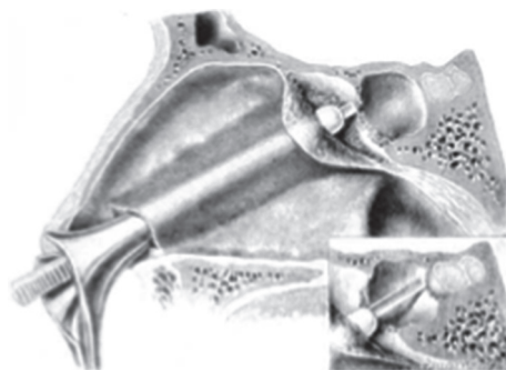
Fig. 2.4 Drawing of Hirsch's endonasal, submucosal and trans-septal approach to the sella (Reproduced from a slide in Dr. Laws' collection. From Lanzino and Laws [39]. Permission required)