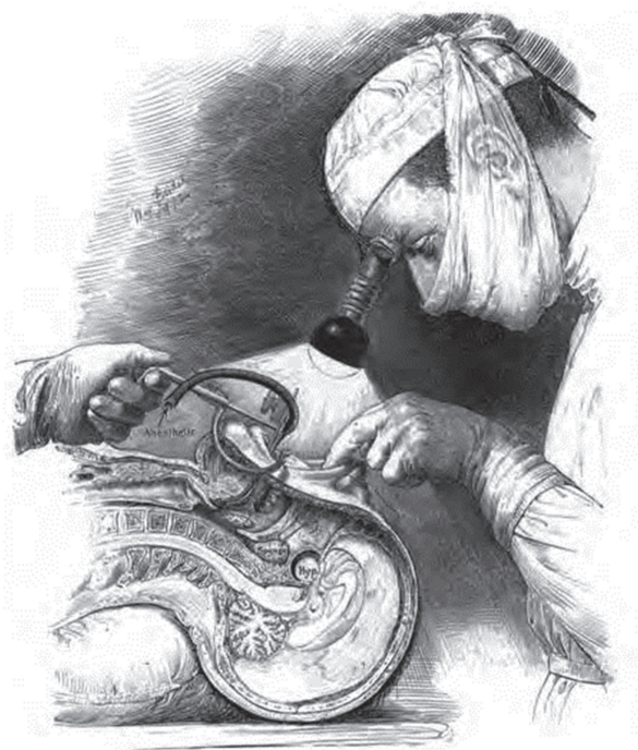
Fig. 2.5 Drawing of Cushing performing trans-sphenoidal surgery (From Cushing [14]. Permission required)