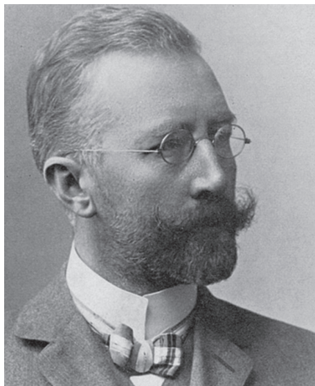
Fig. 2.3 Portrait of Schloffer

2 months after the surgery from hydrocephalus secondary to intraventricular tumour extension confirmed at autopsy [58] (Fig. 2.3).