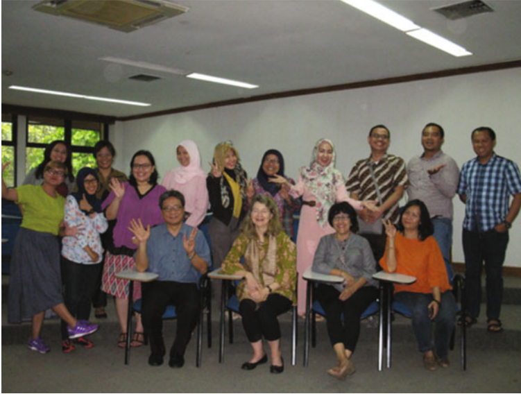
Focus group discussion at the University of Indonesia in 2016 organised by Prof Bam bang

When I insert my ticket [in the train] I feel like a good person. Also people these days are more likely to stand up and make space for people on trains. They are more polite. This makes using trains a more pleasant activity and perhaps more people will be encouraged to use public transport as a result.