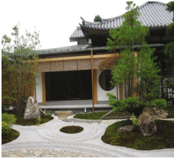
A space for meditation

Globalisation has led to displacements and lack of time which can erode kinship when people move to find jobs or have less time to invest in people and the place where they live. People need to be reminded of their connectedness and dependency through symbolism of humility and a sense of awe for the creative and destructive forces of nature. Facing Mecca, contemplating the face of Buddha or remembering the parable of Christ washing the feet or going to the Bush or the Desert to contemplate nature and to empty the mind become increasingly important.