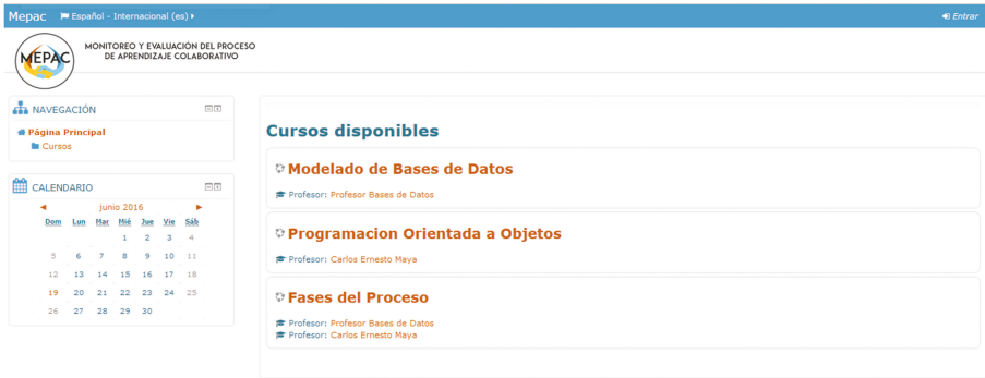
Fig. 2. MEPAC software tool