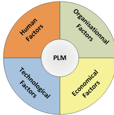
Fig. 1. PLM axis structuration

questions according to new 4 axes: Human Factors, Organisational Factors, Technical Factors and Economic Factors. This new decomposition does not affect the indicators but brings a fluidity and easier understanding for the interviewees (SMEs) (Fig 1).