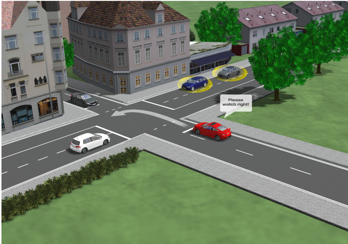
Figure 1: The speech-based on-demand intersection assistant

speech-based interaction is its intuitiveness, as it is similar to the interaction with a human passenger. In addition, drivers do not need to take their hands off the wheel. Moreover, drivers are supplied with personalized recommendations that are based on their previous driving behaviour. The underlying assumption is an increased effectiveness and acceptance of the system due to the adaptation to drivers' preferences.