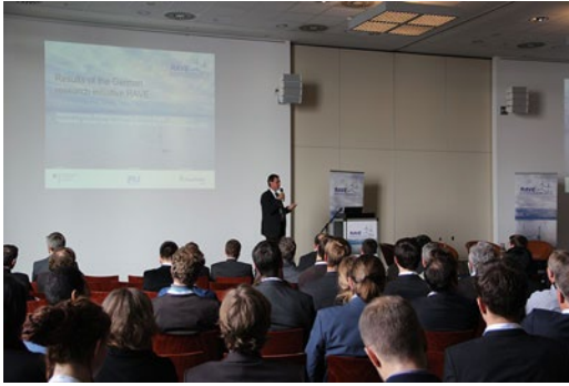
■ Fig. 2.1 Research results from Alpha Ventus, presented at the International Offshore Wind R&D Conference 2015 in Bremerhaven.

same time and at any time. The coordination project eventually involved over 30 projects, as well as over 50 research organisations, institutes and facilities. National and international networking was also part of the job, because offshore wind is not just a German domestic issue.