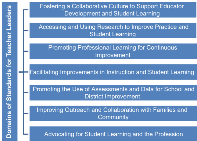
Fig. 2.1 Domains of standards for teacher leaders ( source Smylie 2010)