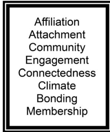
Fig. 2.1 Words indicating a sense of belonging