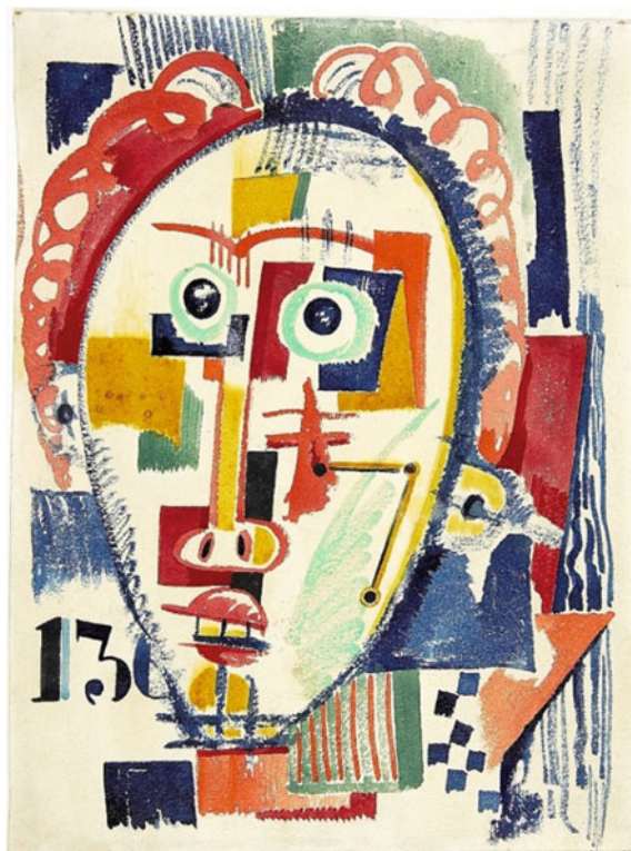
Fig. 11 Tête Ocean (Ocean Head) . Watercolour on paper. 25.4 × 18.8 cm. 1915