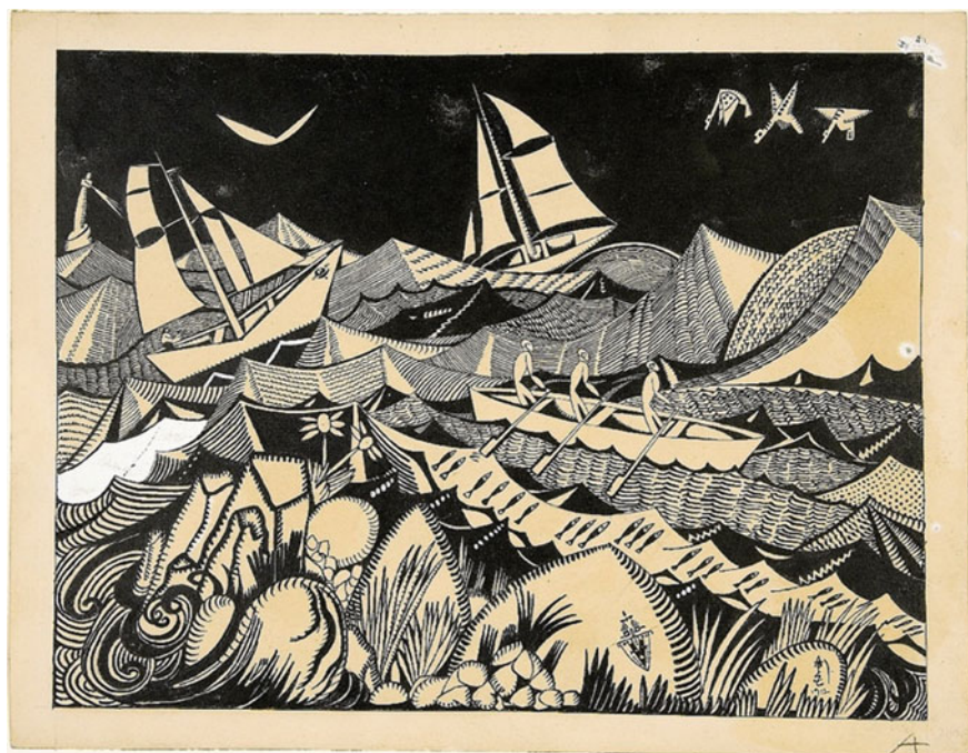
Fig. 9 La Tourmente (The Turmoil) . Original drawing for XX Dessins . Indian ink and gouache on paper. 1912