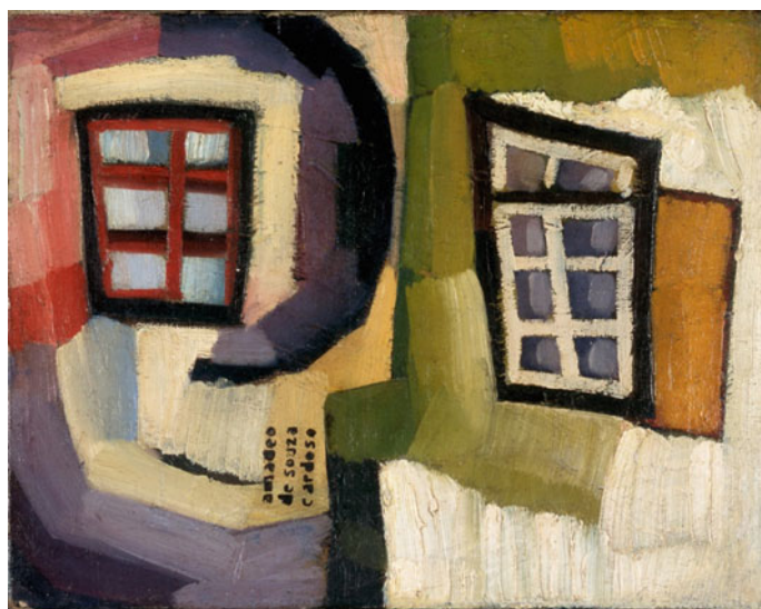
Fig. 12 Title unknown [Janelas do Pescador] . Oil on canvas. 27.4 × 34.8 cm. 1915