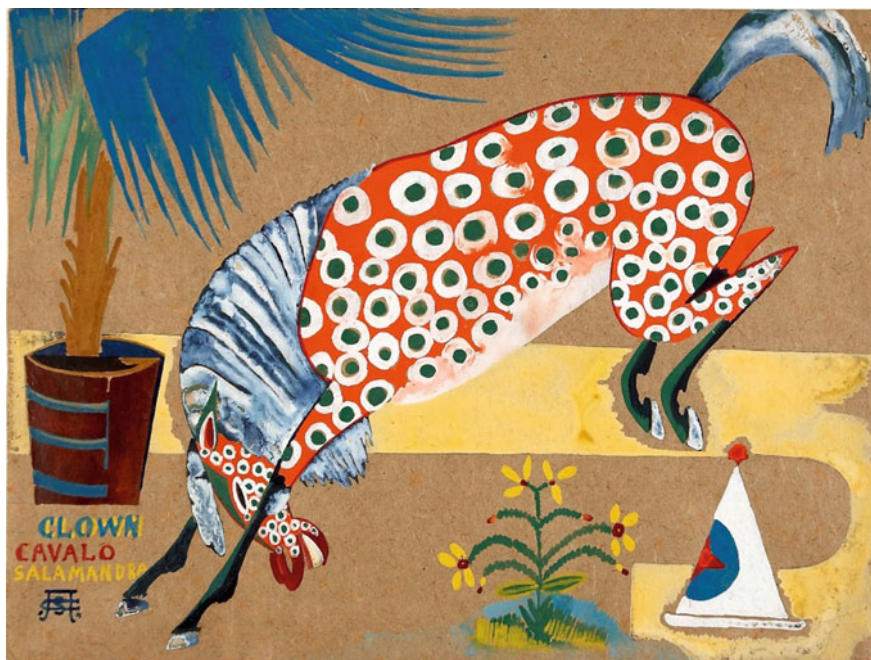
Fig. 8 Title unknown [Clown, Cavalo, Salamandra] . Gouache on paper. 23.8 × 31.8 cm. 1911