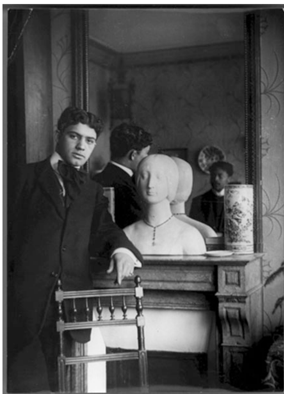
Fig. 2 Amadeo de Souza-Cardoso in his studio, Paris 1907