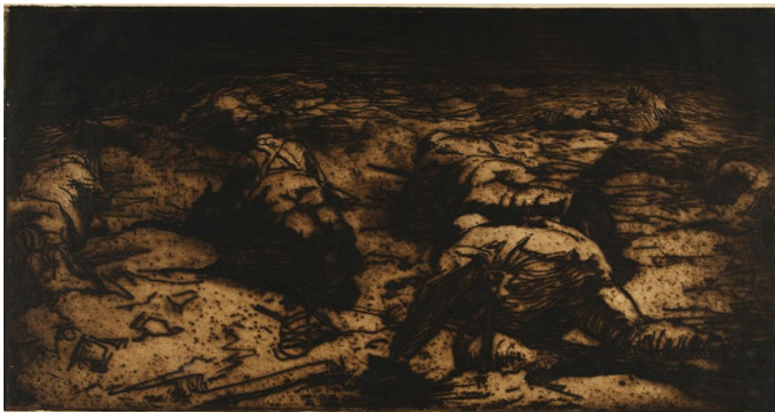
Fig. 5 Patrulha de reconhecimento na Terra de Ninguém ( Reconnaissance patrol in no man's land ). Etching on paper, 56.4 × 75.3 cm. 1919

The same occurs with the drawings which serve as studies for the large-scale oil paintings. In terms of the structure of the composition and the technical dexterity of the various elements, they are almost identical to the final works. We can ascertain this, for example, in Estudo para a Destruição de um obus 11 ( Study for Destruction of a howitzer , 1918–1919) and the final oil painting, 12 where an episode in the battle of La Lys is depicted, which the artist would not have observed but would have known about through his companions. In both images, the centre is occupied by the shell and by a soldier who stands holding a pick-axe. He tries desperately to destroy the howitzer, to avoid letting it fall into the hands of the enemy, who arrive on the left-hand side, wielding their weapons.