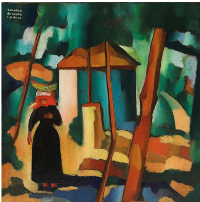
Fig. 13 Figura Negra (Black Figure) . Oil on canvas. 50 × 50 cm. 1914

From 1914 to 1916, the painter prepared 111 works for exhibition in Portugal and the United States. Exhibitions were held in Oporto and Lisbon, and were as visited as they were misunderstood. From the conflict between the process of maturity and the frustration of artistic misunderstanding, his final phase brilliantly emerges with a burst of creativity. Traces of the war are present and implicitly suggested by the changes in the colour palette and by the absence of his usual points of reference: vitality and confidence, joy and magic (Fig. 13).