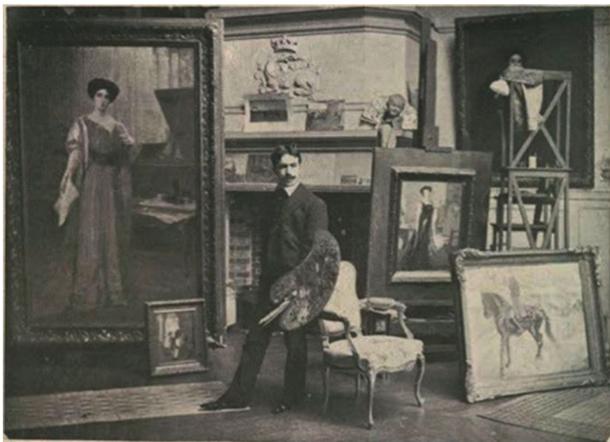
Fig. 1 Retrato de Mulher ( Portrait of Woman ), painted by Sousa Lopes, Inv. 566