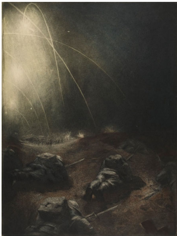
Fig. 4 “ Very-lights ”. Etching and water colour on paper, 65.1 × 51.9 cm. 1919