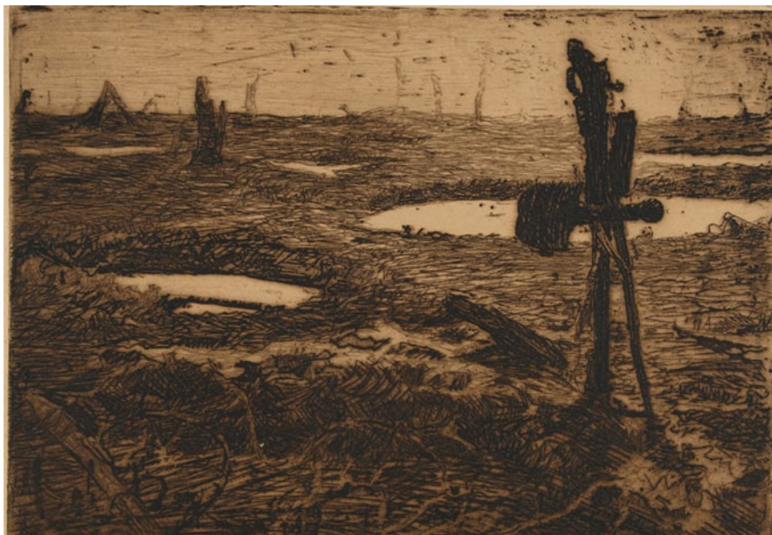
Fig. 3 Sepultura de um soldado português desconhecido, na Terra de Ninguém (Grave of an unknown Portuguese soldier in no man's land) Etching on paper, 21 × 29.2 cm. 1918

Cena de Batalha 6 ( Battle Scene , 1918–1920) and Bombardeamento aéreo 7 ( Aerial Bombardment , 1918) are set in nocturnal environments that challenge the artist's aesthetic in terms of palette and light concentration/diffusion. The first, vertically composed, has a base of dark green tones, where subtle black contours suggest the soldiers' heads, placed along a trench. Orange tones illuminate these figures, evoking flashes of fire. In the middle plane, a mixture of blacks and blues, applied in circular strokes, suggest column of smoke. On the highest plane, a dark blue assumes the hue of the night sky. In the second picture, the brightening effect of colour is heightened. Bombs fall from the sky, leaving light beams in their trails which cross each other. As they fall to the ground they provoke fire flashes that illuminate the space, in shades of yellow and red. In these pictures, we can see the same compositional freedom present in the drawings made at the battle front, to which is added a more expressive (pure) use of colour than in the pictures painted for the Lisbon Artillery Museum (current Military Museum of Lisbon) (Figs. 3 and 4).