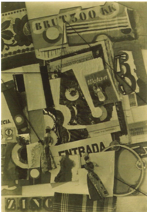
Fig. 17 Preparatory study of [Entrada]. 1917

becomes torn in the painting. The study is filled with a profusion of eyes and dark circles, holes that attract our gaze into the depths.