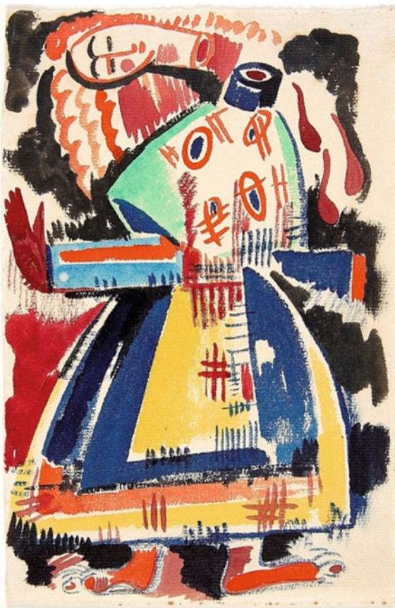
Fig. 10 Mulher Decepada brisement de la grace croisée de la violence nouvelle ( The breaking of grace, marked by the cross of a new violence ). Watercolour on paper. 24 × 15.8 cm. 1914

the background. The caption which accompanies the image leaves no room for doubt: grace has been broken (Fig. 12).