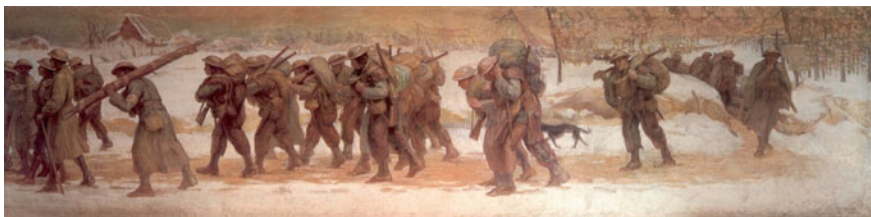
Fig. 7 A Rendição (The Surrender) . Oil on canvas. 296 × 1252 cm. 1919–1922. Inv. n° 000592

dehumanization as its goal. The war, a cruel and traumatic experience, is shown to us through the eyes of these artists, who will not allow any other interpretation except their own (Fig. 7).