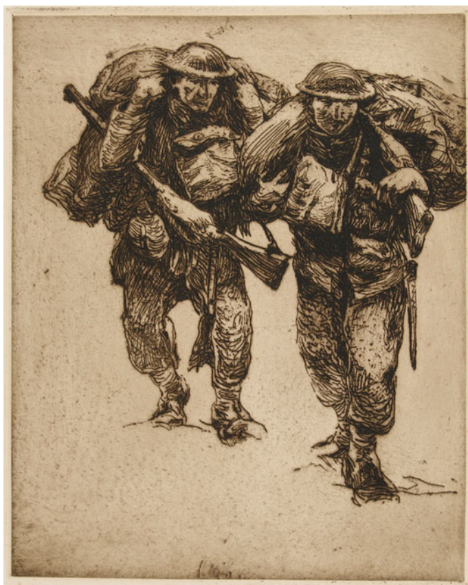
Fig. 6 Duas ordenanças de Infantaria 11 ( Two ordinances of 11th Infantry). Etching on paper, 30.8 × 24.5 cm. 1918

soldiers in the new trench warfare, showing them as moving ghosts. It should be noted also that the soldiers walk in an inverse direction to the viewer, that is, from right to left, as if they were walking backwards. They surrender, as the title states, and remove any trace of hope in the future. They are condemned beings and everything that surrounds them points to it. Yet again, the “glorious effort of the Portuguese people” 17 is underlined.