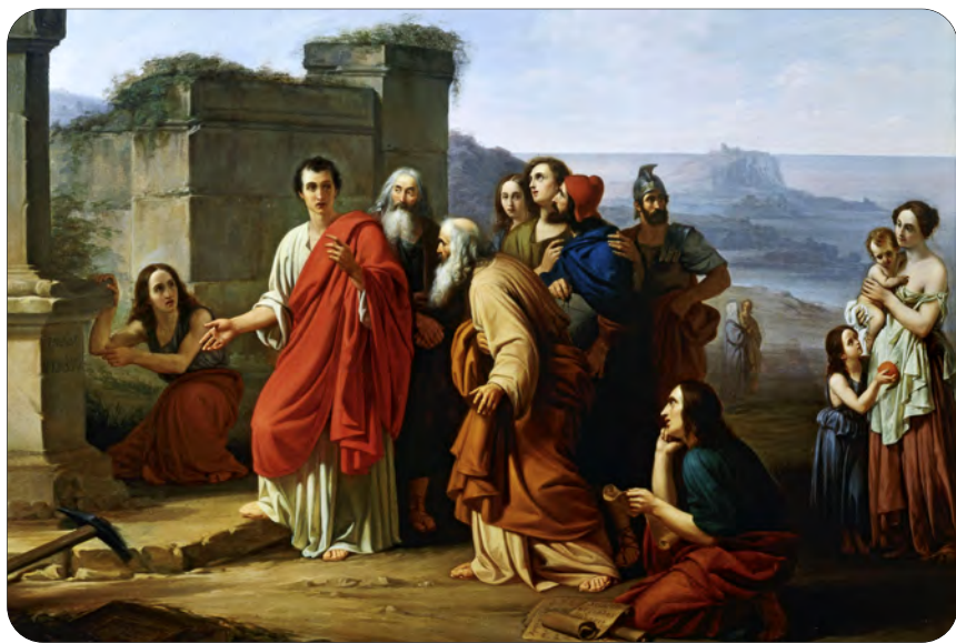
Nineteenth-century painting of Cicero discovering the tomb of Archimedes. In Section C we see how the Archimedean Property of the real numbers follows from the completeness property.

In Section E of this supplement we prove the Bolzano–Weierstrass Theorem, which is then used as a key tool for results concerning uniform continuity and maxima/minima of continuous functions on closed bounded subsets of \mathbf{R}^n .