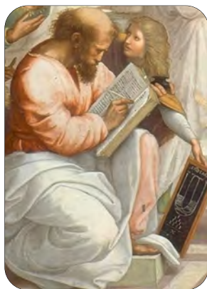
Pythagoras explaining his work (from The School of Athens, painted by Raphael around 1510).

This contradiction means our original assumption that there is a rational number whose square equals 2 was incorrect, completing the proof. ■