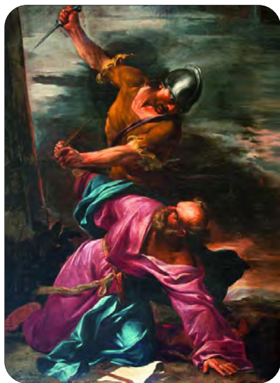
The death of Archimedes, as depicted in a seventeenth-century painting.

The Archimedean Property states that if t is a real number, then there is a positive integer larger than t . This result surely does not surprise you. What may surprise you, however, is that this result cannot be proved using only the properties of an ordered field. Completeness must be used in every proof of the Archimedean Property because there are ordered fields in which this result fails (for an example, see Exercise 9 in this section).