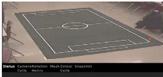
Fig. 2. A sample view of the playing field

In the F180 league, each team provides their own video camera and mounts it in their desired position. Most teams choose to place the camera directly overhead. This means that the local organizing committee must provide a physical structure above the playing field onto which teams can mount their cameras. However, the limited angle of view requires that a wide-angle lens be mounted on the camera in order to have a view of the whole playing field. Doraemon has more complex camera calibration routines and is not limited to overhead views (see figure 2).