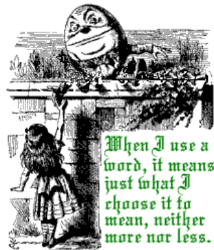
Figure 1. About the meaning of words (from Alice in Wonderland)